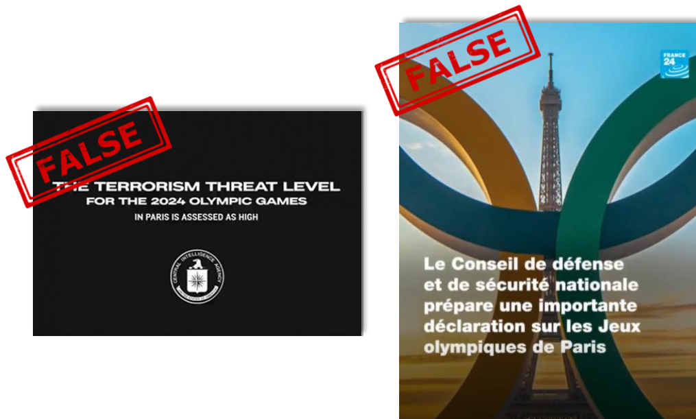
Figure 2: A faked video press release warning the public of possible terror attacks at the 2024 Paris Summer Olympics (left). A fabricated France 24 news clip claiming that nearly a quarter of Paris 2024 tickets have been returned due to concerns over terrorism (right). Both forgeries were produced by Russia-affiliated actor Storm-1679.

The most worrisome disinformation advanced by pro-Russian actors has sought to impersonate militant organizations and fabricate threats to the Games amidst the Israel-Hamas conflict. During fall 2023, Storm-1679-linked social media accounts posted images claiming to show graffiti painted in Paris that threatened violence against Israelis attending the 2024 Games. In several of the images, Storm-1679 referenced the attacks at the 1972 Munich Olympics, where members of Black September—an affiliate of the Palestine Liberation Organization—killed 11 members of the Israeli Olympic team and a West German police officer. 13 Microsoft did not observe any independent confirmation that the graffiti physically exists, suggesting the images were likely digitally generated. Separately, in November 2023, a Russian-language X (formerly Twitter) account posted a video purportedly produced by the Turkish ultranationalist organization the Grey Wolves, which included imagery from the 1972 Munich Games attacks, hinting at similar attacks at Paris 2024. The video caused significant confusion online in the hours after it was posted, many assuming it to be authentic, and even prompted a response from the Israeli Olympic Committee. 14 Microsoft does not presently have enough information to attribute the video to a specific actor, but its heavy amplification by pro-Russian bot accounts suggests the video may be another operation in the broader Olympics campaign. 15