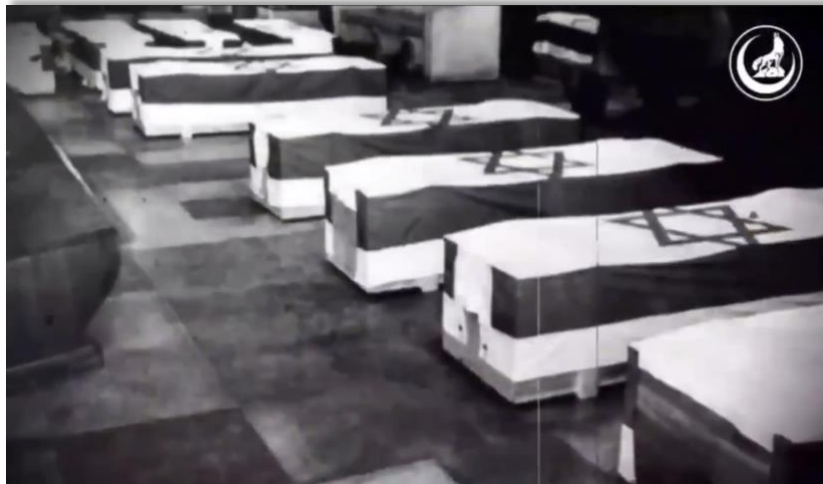
Figure 3: A still image from the false-flag terror threat, purportedly from Turkish ultranationalist group the Grey Wolves, whose symbol is visible in the top-right corner of the screen. The video was widely publicized by pro-Russian bot accounts and prompted a response from the Israeli Olympic Committee.

Storm-1679 is not the only Russia-aligned actor with a particular—and growing—interest in undermining the 2024 Paris Games. The Russia-affiliated influence actor Microsoft tracks as Storm-1099—better known as “Doppelganger” —has also increased its anti-Olympics messaging in the past two months. Articles published by the actor’s core disinformation outlet Reliable Recent News (RRN), as well as any of its 15 unique French-language “news” sites, echo claims of rampant corruption within the IOC and warn of potential violence at the Games. Similarly, in Storm-1099’s spoofs of reputable media outlets—pro-Russian clones of legitimate media websites peddling propaganda—forgeries of French outlets Le Parisien and Le Point also raise the specter of violence and castigate Macron’s government. Posts in this network of forgeries criticize Macron’s showmanship around the Games and emphasize his indifference to the socio-economic hardships faced by French citizens. 16