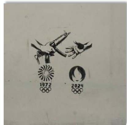
Figure 4: An image of graffiti, reportedly left in Paris, threatening a repeat of the 1972 Munich terror attacks at the upcoming Olympic Games in Paris.

Storm-1679 is not the only Russia-aligned actor with a particular—and growing—interest in undermining the 2024 Paris Games. The Russia-affiliated influence actor Microsoft tracks as Storm-1099—better known as “Doppelganger” —has also increased its anti-Olympics messaging in the past two months. Articles published by the actor’s core disinformation outlet Reliable Recent News (RRN), as well as any of its 15 unique French-language “news” sites, echo claims of rampant corruption within the IOC and warn of potential violence at the Games. Similarly, in Storm-1099’s spoofs of reputable media outlets—pro-Russian clones of legitimate media websites peddling propaganda—forgeries of French outlets Le Parisien and Le Point also raise the specter of violence and castigate Macron’s government. Posts in this network of forgeries criticize Macron’s showmanship around the Games and emphasize his indifference to the socio-economic hardships faced by French citizens. 16