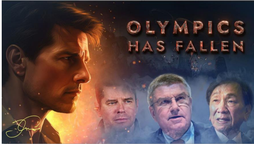
Figure 1: A visual from the fake documentary "Olympics Has Fallen", produced by Russia-affiliated influence actor Storm-1679, which targets the International Olympic Committee and advances pro-Kremlin disinformation. The documentary uses the image and likeness of American actor Tom Cruise, who did not participate in any such documentary.

edited the videos into anti-Ukrainian propaganda. Among the edits to those Cameo videos included advertisements for Olympics Has Fallen and QR-code links to the Telegram channel where it was hosted, giving the false impression that American celebrities were endorsing and promoting the film.